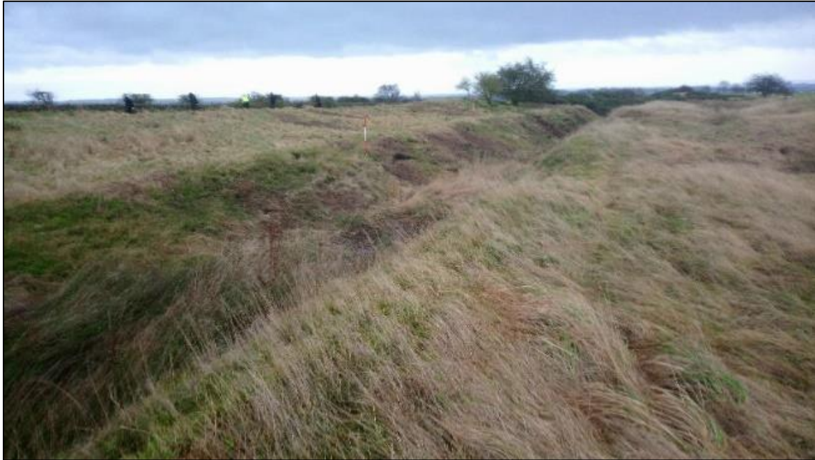
Figure 3: Site after scrub clearance