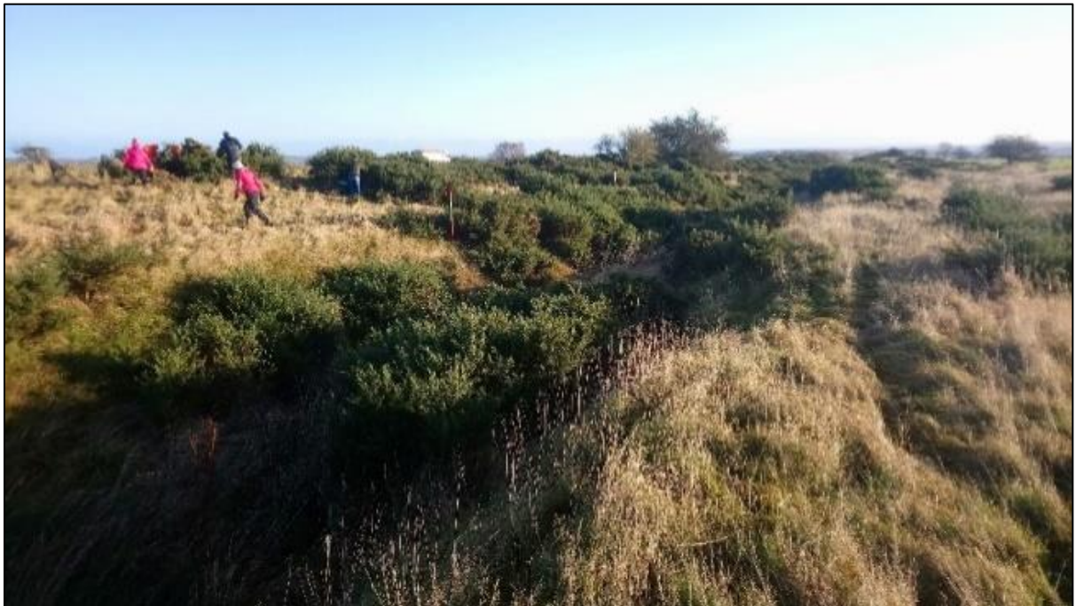
Figure 2: Site before scrub clearance

Activity: Scrub removal was undertaken using hand tools (bow saws, loppers and pruning saws) by WallCAP volunteers, under supervision of the WallCAP Community Archaeologist. All cut material (gorse and small trees) was chipped and spread on rough pasture in the northwest corner of field (with permission from Historic England).